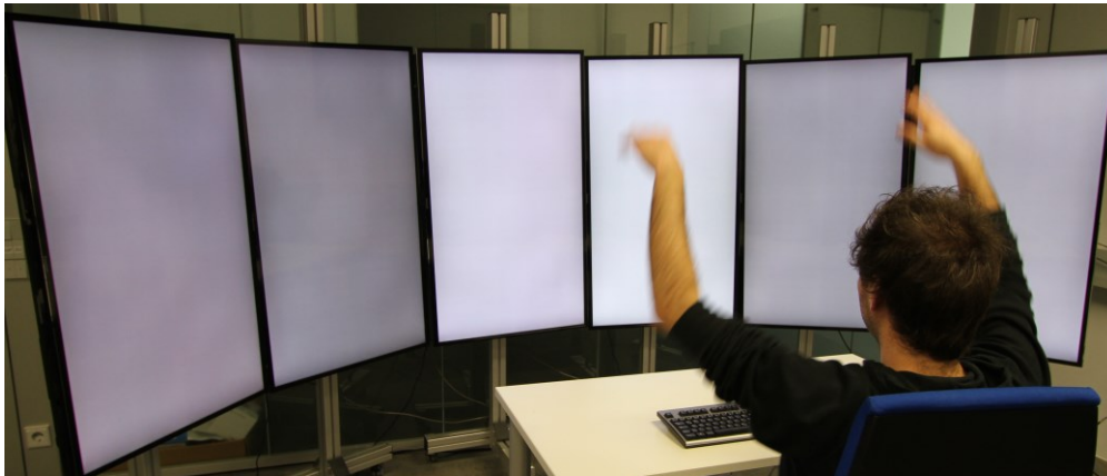
Figure 2: A participant is performing a gesture.

Inspired by Wobbrock (Wobbrock et al. 2009), we conducted a user study to design a gesture set for manipulating application windows. We recruited 10 male and 2 female participants through our mailing lists. In the study, we ask them to perform gestures for a given command set (see Fig. 1). We repeated this for every command and participant three times. For analyzing the performed gestures, we recorded all sessions on video. Through the analysis of the user study, we were able to generate a set of gestures to perform the 14 most common window management tasks e.g. select window, move window or resize. In a second step, we implemented the gesture set as fully working application for Windows 8.1.